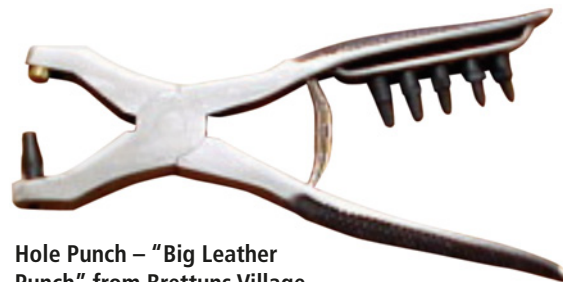
Hole Punch – “Big Leather Punch” from Brettuns Village (brettunsvillage.com/leather/tools/tools/#punch)