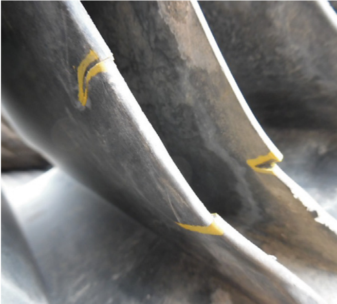
Spoke Edge Cracks