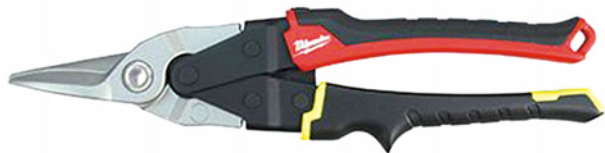
Milwaukee 48-22-4030 Aviation Snips, Straight Cutting