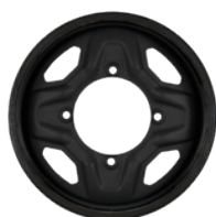
MSPN 75085 & 82599