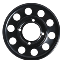
MSPN 21709 & 29242