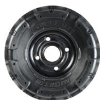
MSPN 68495, 67693, 65492, 64998 & 03488