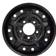
MSPN 49265 & 10545

Note: All UTV/ATVs use 60° / Conical / Tapered Lug Nuts.