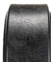
15" Smooth Polyresin Tread