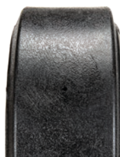
15 po lisse Polyrésine