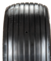
13 po rainurée Polyrésine