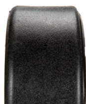
13 po lisse Polyrésine